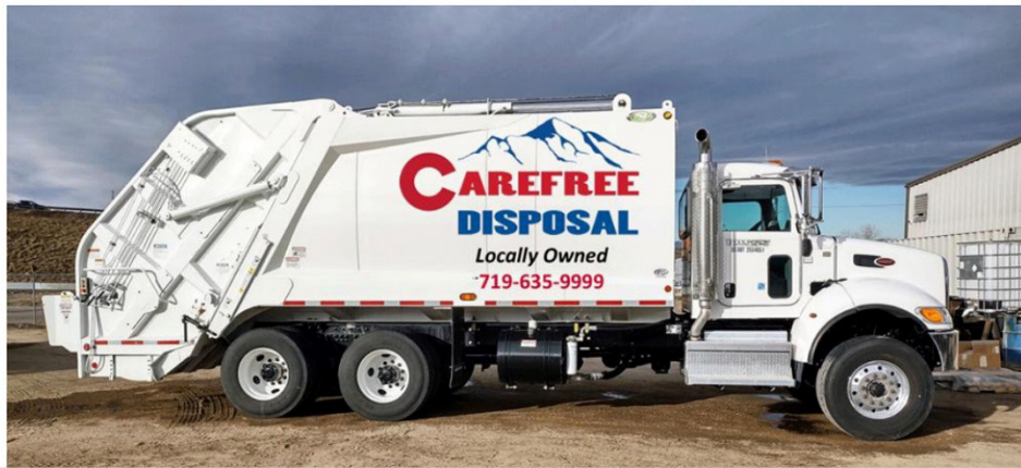
Carefree Disposal will become the latest competitor March 1 in the suddenly crowded Colorado Springs trash market.

Two former longtime employees of Bestway Disposal have joined with two trucking industry veterans to form Carefree Disposal , the latest entrant into the suddenly crowded Colorado Springs trash market.